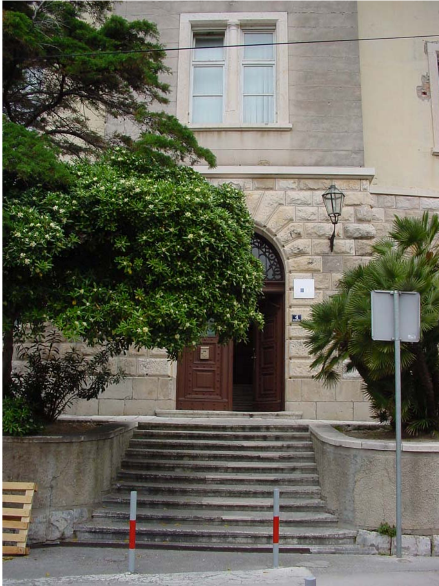
INTER UNIVERSITY CENTER DUBROVNIK (IUC)